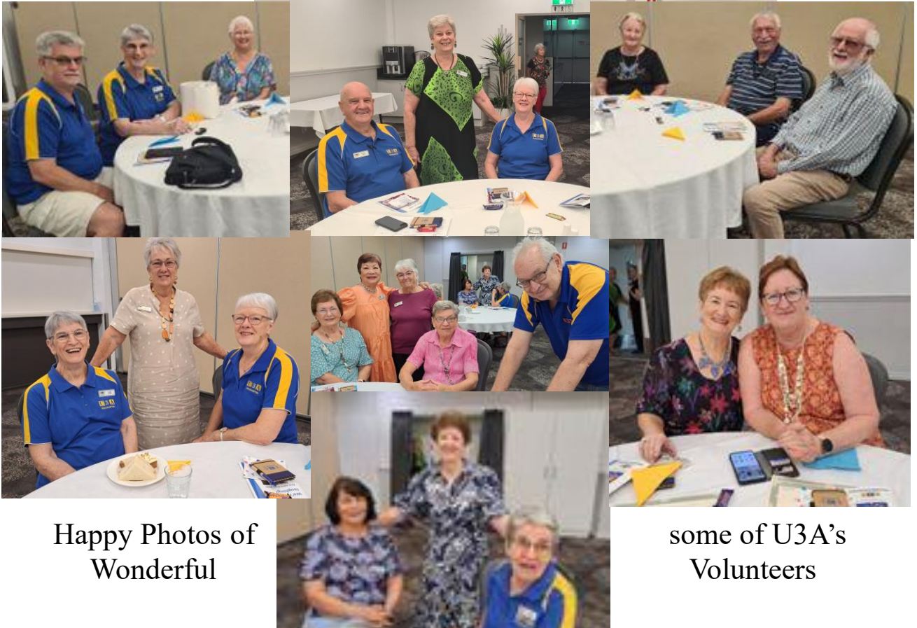
Happy Photos of Wonderful