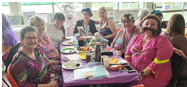
Members Christmas Lunch

We would like to wish you and all the people you love a very Holy Christmas and a Healthy and Happy 2024