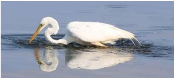
An Egret on Murray Lagoon

In early November we were went to Murray Lagoon, an excellent bird watching venue during good weather. When we arrived it had continued to dry up with the edge of the water about 3m out from the end of the jetty.