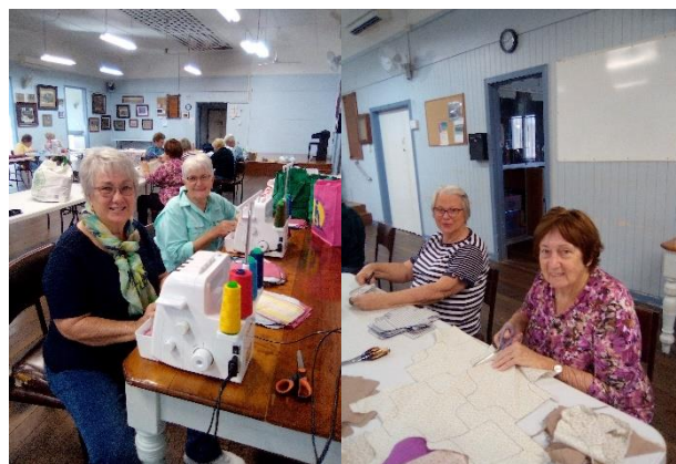
Busy at work

Ian Ewings Group U3a Photography meets at the Walter Reid Building, cnr. Derby and East Sts on 2 nd & 4 th Thursdays at 2.00pm for Meet and Greet, then off to the Club room for display of Photographs.