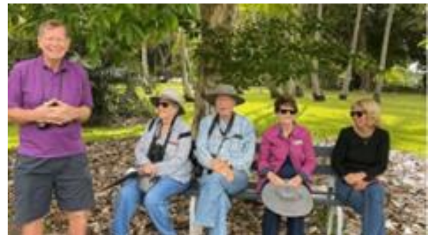
U3A Birdwatchers taking a spell