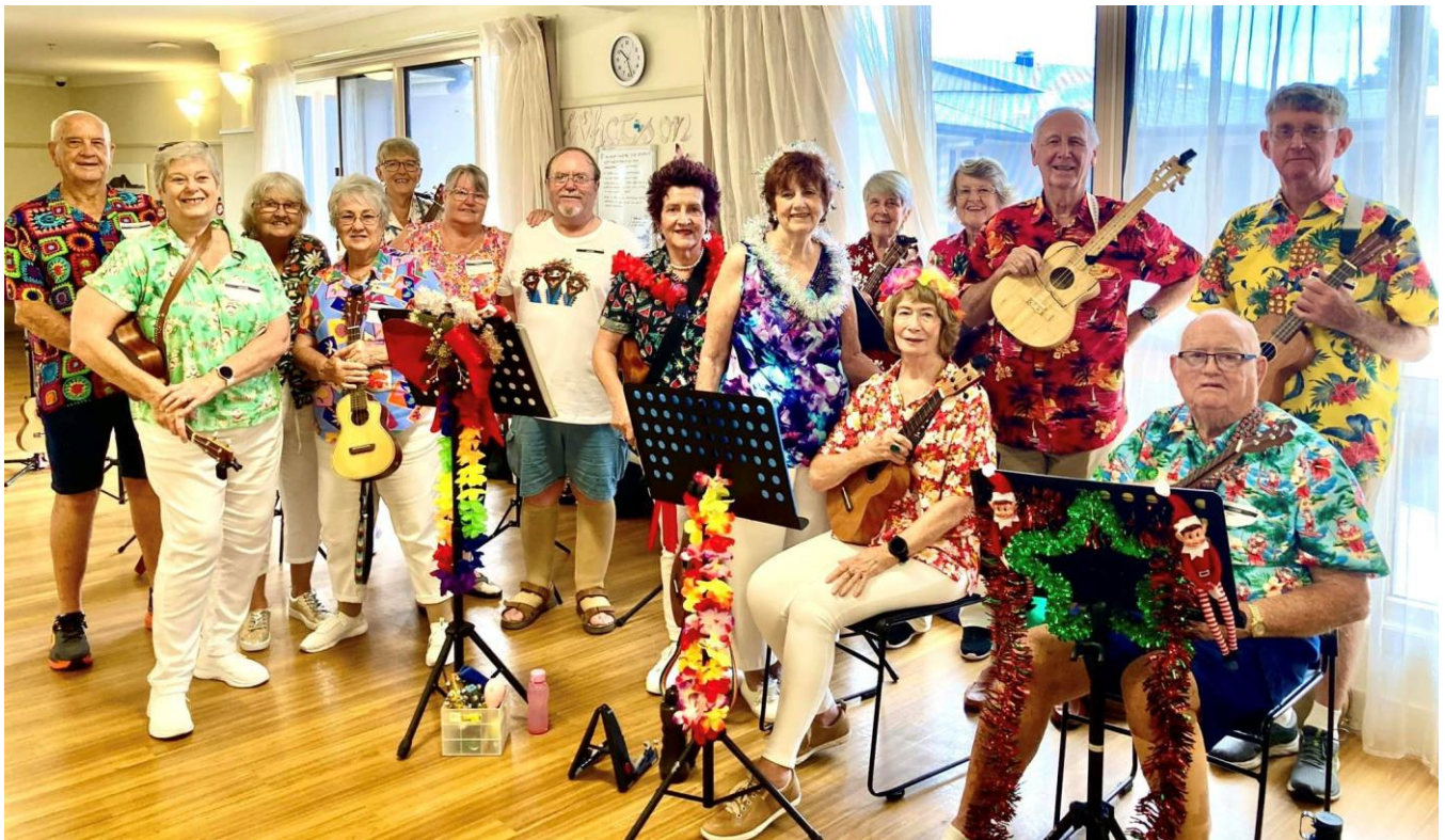
ROCKHAMPTON U3A UKULELE GROUP at Sunset Ridge, Zilzie