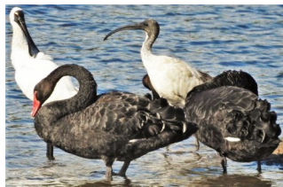
Spoonbill, Ibis, Swan