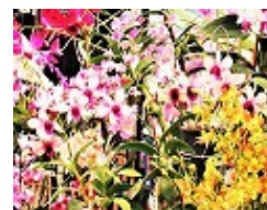
Queens visit 1954