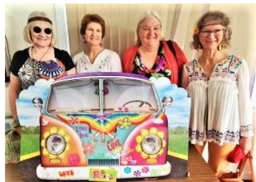
U3A members enjoying themselves at the "Back to the 60's Trivia quiz" in October.