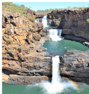
Mitchell Falls, WA