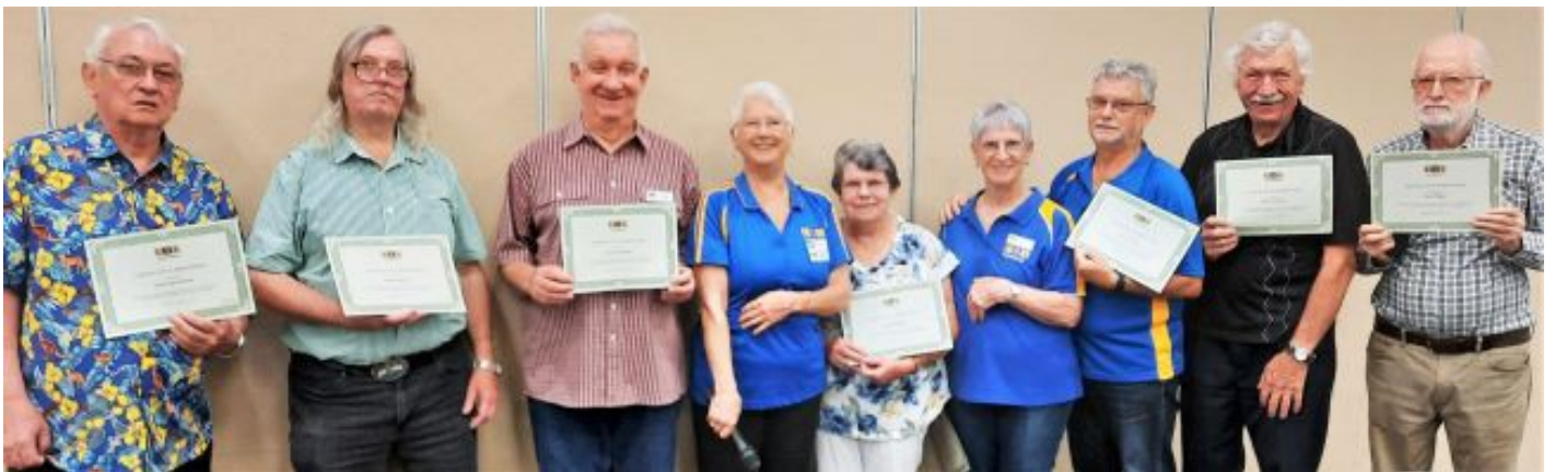
Just a small group of our champion volunteers who received certificates of appreciation at our morning tea on 31 st October 2022

https://www.u3arockhampton.org.au/images/dec22.pdf