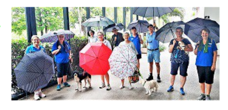
Rain will not stop play

We exercise our talking muscles as well as our walking muscles not to forget the all important cuppa at a chosen cafe as a finale.