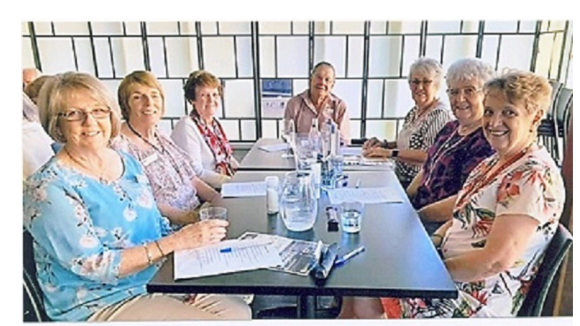
Group of U3A lunch goers puzzling a quiz while waiting for lunch

These lunches are proving to be very popular and is a great place to have a chat and meet new friends.