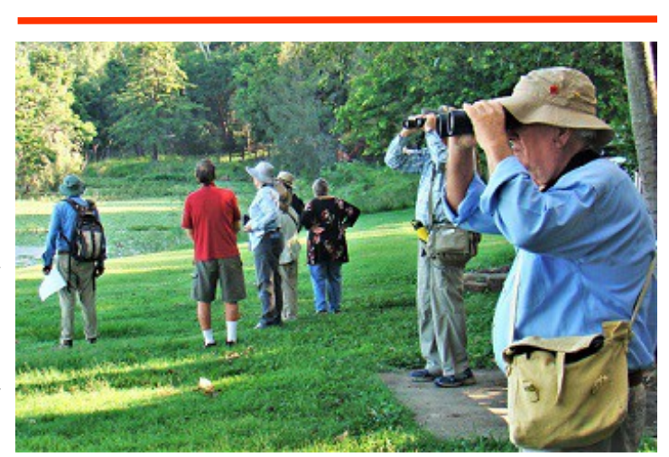
Which bird is that? Bird watching at Murray Lagoon

Photographs are valuable also and I realise a few amongst us are not sufficiently up with the technology to be able to send jpeg images. If you have a photo you would like published – then please hand to me I am able to scan and print the photo and return to you.