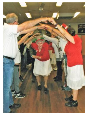
Photo shows members enjoying Grandma's Gallop.