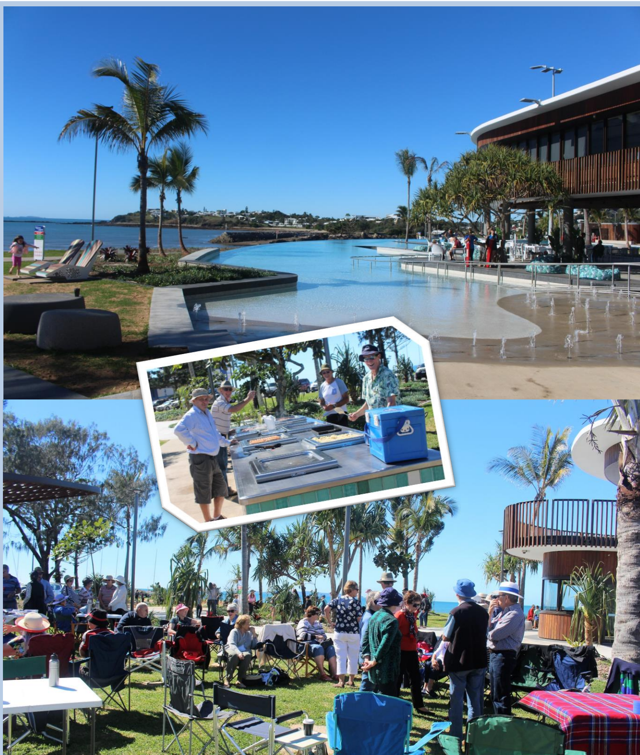
Pictured: Joint outing with Capricorn Coast U3A at Yeppoon's new lagoon

General Meeting 1st Monday of each Month (ex January) 9.30am at Frenchville Sports club Next meeting after September 3 rd 2018: October 1 st 2018